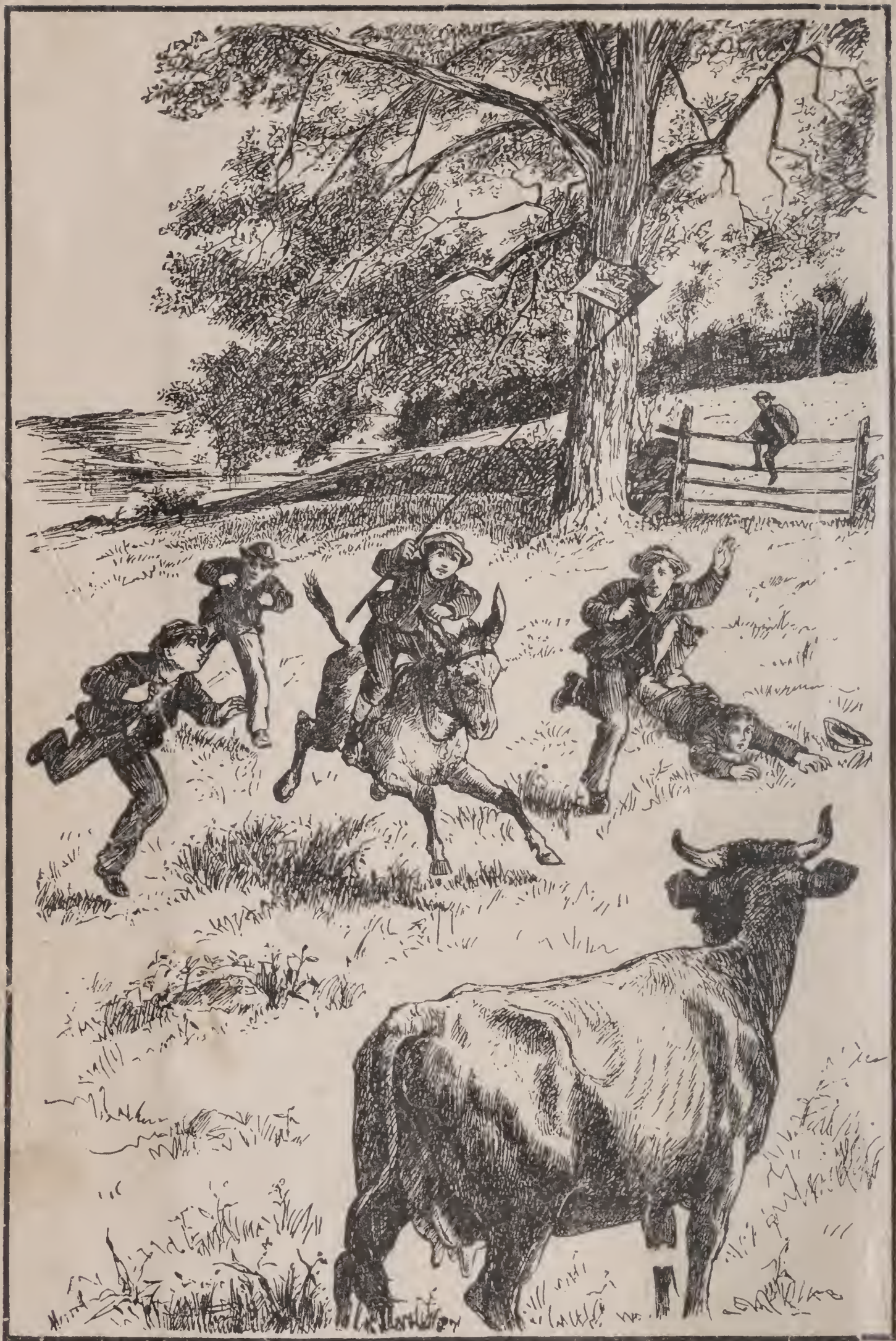
“Tommy rode gallantly at her, and Toby, recognizing an old friend, was quite willing to approach.” — PAGE 100.